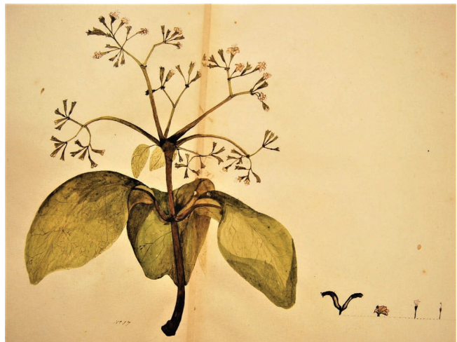
Fig. 4. No. 17 Pisonia brunoniana Endl. (Nyctaginaceae).

This is the second watercolour of this tree in the series; the other is Drawing No. 3. The two illustrations are similar and show the stems, leaves, small flowers and developing fruit; No. 3 is the better painting.