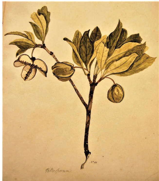
Fig. 7. No.33. Pittosporum bracteolatum (Pittosporaceae), a tree endemic to Norfolk Island. Attributed to John Doody, c.1792. (Mitchell Library, Sydney DLP XX 1.)

This tree, related to the edible olive and previously named Olea apetala , is very common in the rainforest on the island. The species also occurs in New Zealand, from where the type specimen was collected. The watercolour shows a fruiting stem with leaves, along with a small drawing of a cross-section of a fruit.