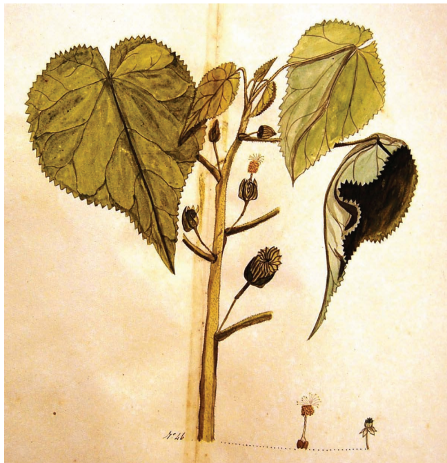
Fig. 10. No.46 Abutilon julianae (Malvaceae), a Norfolk Island endemic shrub. Attributed to John Doody, c.1792.

flowers and typical dry fruit of Abutilon ; see Figure 10. Smaller sketches of flower parts are also shown. A pencil note reads 'Sida', a genus in the same family as Abutilon , below that is 'cf asiaticum'. The plant being referred to is the African species now known as Abutilon asiaticum .