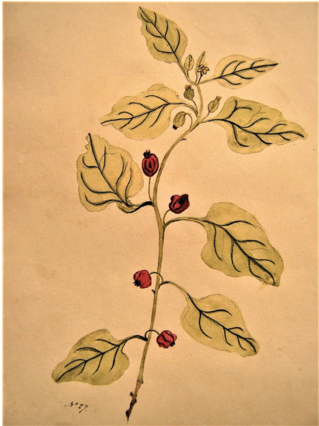
Fig. 6. No. 27 Tetragonia implexicoma (Aizoaceae) Attributed to John Doody, c.1792. (Mitchell Library, Sydney DLP XX 1.)