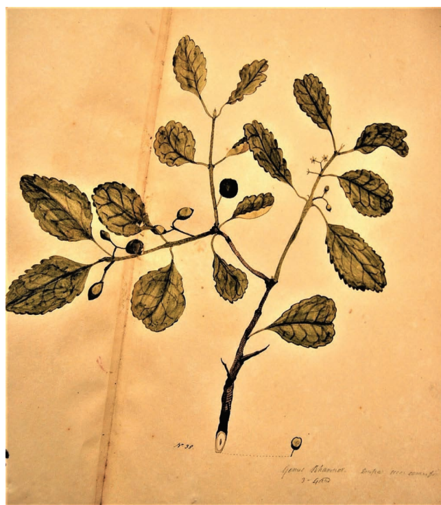
Fig. 8. No. 38 Elaëodendron curtispiculum (Celastraceae). Attributed to John Doody, c.1792. (Mitchell Library, Sydney DLP XX 1.)

This tree is quite common on the island, often growing on dry ridges. The watercolour shows a stem and leaves, along with the distinctive dentate leaves, some small flowers, immature fruit and the blue-black mature fruit, along with a small sketch of a cross-section of a fruit; see Figure 8. Pencil notes are ' Genus Rhamnos ', referring to the family Rhamnaceae, and ' Drupe seed (?) cerussatus '; another note is difficult to decipher. ' Cerussatus ' meaning 'white lead' refers to the colour of the fruit, which are covered in a whitish bloom. The type specimen comes from Norfolk Island, although the species is not endemic to the island.