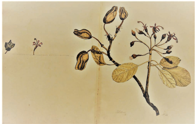
Fig. 9. No.44 Ungeria floribunda (Malvaceae), a genus endemic to Norfolk Island.

This is an interesting monotypic genus that is endemic to Norfolk Island. The large brown, ribbed fruit are illustrated, as are the large leaves and an inflorescence of red flowers; see Figure 9. Smaller sketches show flowers and a cross-section of a fruit. The pencil note 'Helicteres' refers to another genus in the family Malvaceae; a stylised 'B' is written beside the name.