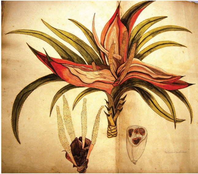
Fig. 2. No. 1 Inflorescence of Freycinetia baueriana (Pandanaeae), an endemic monocot. Attributed to John Doody, c.1792. (Mitchell Library, Sydney DLP XX 1.)