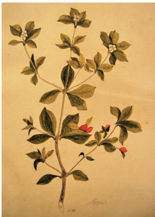
Fig. 5. No.22 Alyxia gynopogon (Apocynaceae), a Norfolk Island endemic shrub.

white flowers and bright orange/red fruit characteristic of this species; see Figure 5. A pencil note says 'Alyxia'.